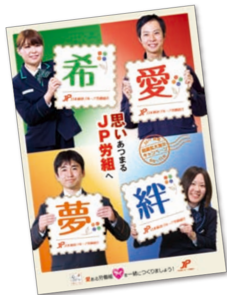
PR poster for new members

For the sustainable business development of Japan Post Group, the employment security and the better working conditions of JPGU members, JPGU needs to build up a strong union membership of 300,000. Achieving this figure is one of the priority issues to realize the "true happiness of members." Thus, JPGU is undertaking this purpose at full power.