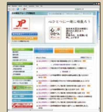
JPGU website URL http://www.jprouso.or.jp

A members-only section of the JPGU website is also available, in which members are able to find updated bargaining information, and discover whether they are eligible for special accommodation-saving benefits.