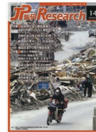
"JPGU Research" is released 4 times a year.

JPGU has its own research organ where postal & logistics, finance, and labor policy issues are studied, the results are then published.