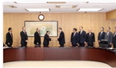
The Submission of 2011 Spring wage hike demands to management

In addition, JPGU has collected the opinions and requests from front-line workers and negotiate at the national level in order to improve their working conditions, the environment of workplaces, and so on.