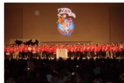
The Nagasaki Congress of Year 2010

In 2010, when the 3rd UNI world congress was held in Nagasaki, Japan, a lot of JPGU volunteer members joined to help that congress. JPGU continues to foster union members who are able to play active roles in the international trade union movement.